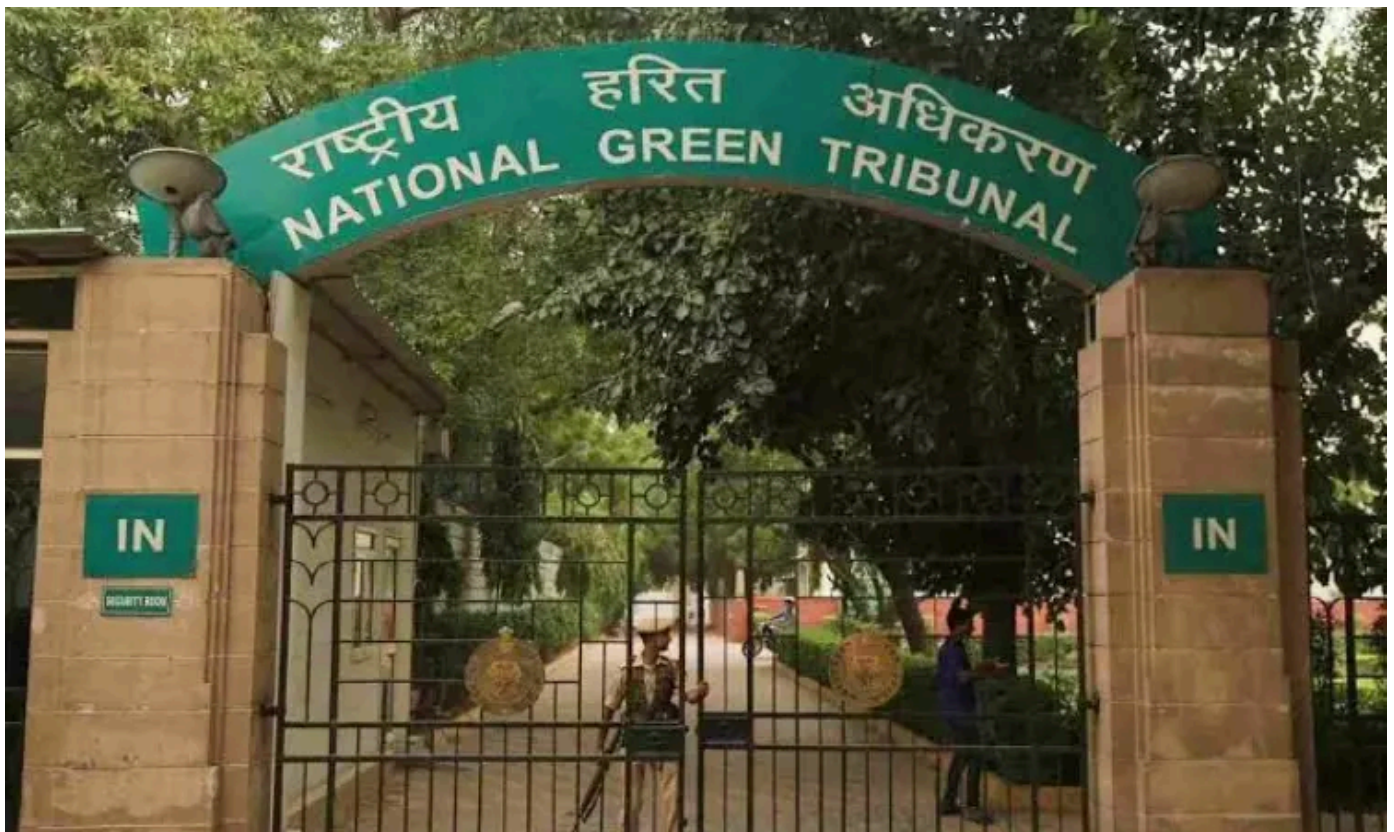
National Green Tribunal (NGT)